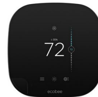
ecobee3 Smart Wi-Fi Thermostat $24995