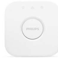
Philips HUE HomeKit Upgrade Bridge (for Current HUE ... $5995

Technologies of home automation should be more user friendly and affordable.