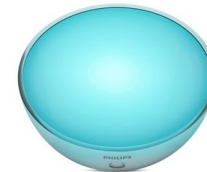
Philips Hue Go $9995