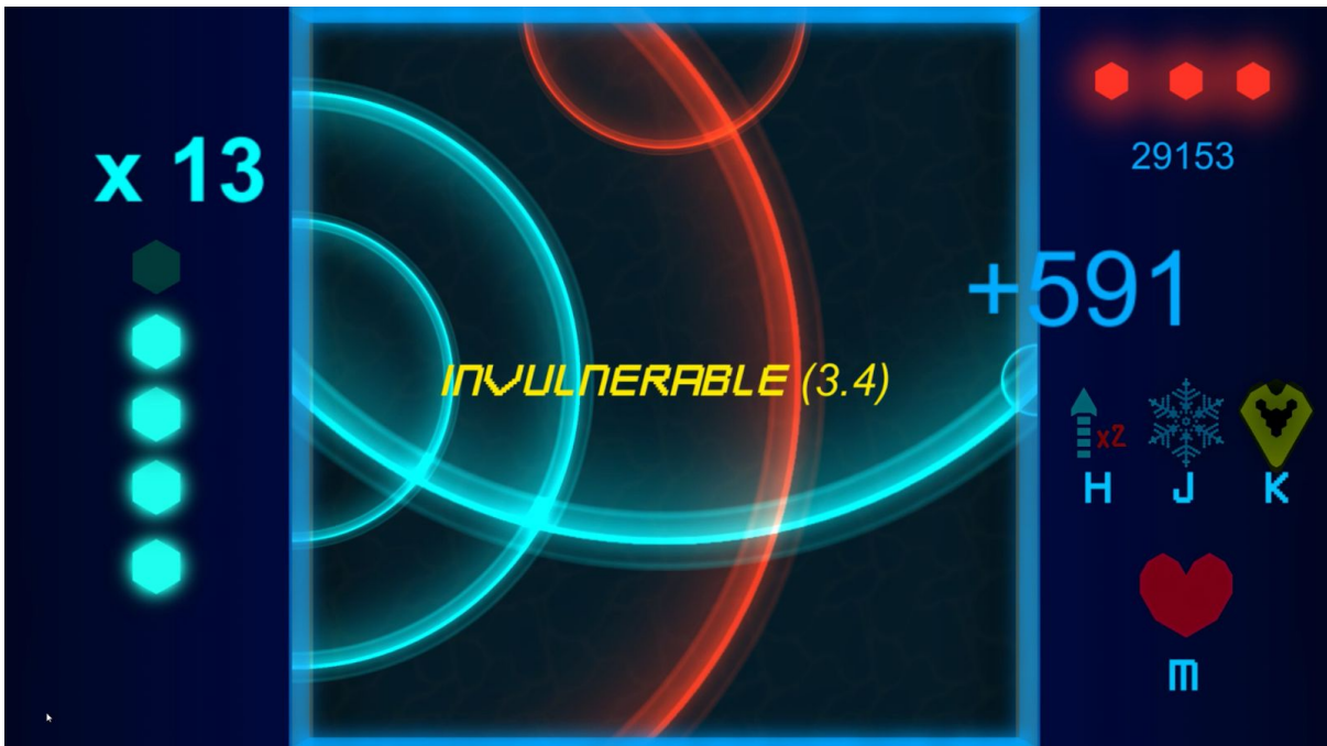
Gameplay: Invulnerability Power-Up activated