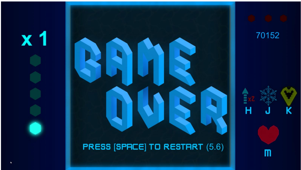
Game Over Screen